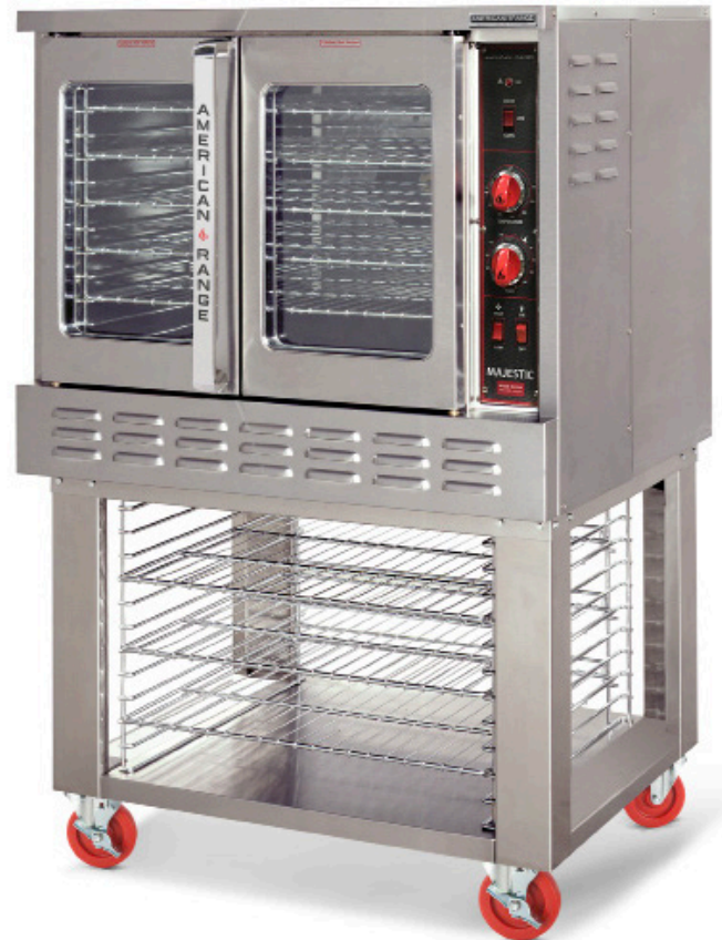
Model Shown MSD-1GG (Standard Depth)

Shown with optional casters and adjustable cooling / storage rack.