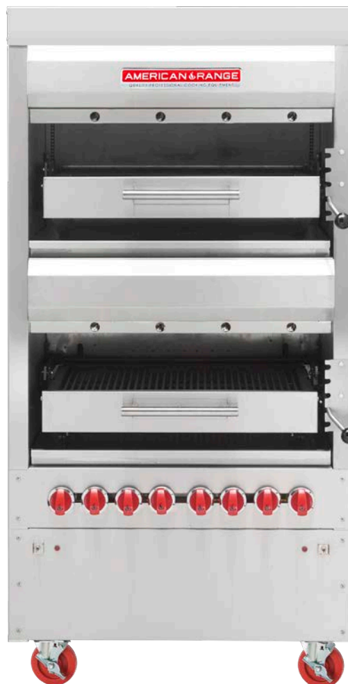
Model AGBU-2 (shown with optional casters)