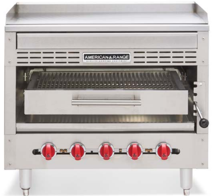
HG45-RGBSH Shown with optional casters and stand.

HD-RGBSH models have high efficiency Inconel burners that achieve 1800° surface temperatures for searing perfection. Infrared burners direct heat waves downward to penetrate the exposed surfaces of the meat. Meat is cooked entirely by infrared heat. Meats experience minimal shrinkage while retaining juices, tenderness and flavor. Broiler has adjustable valve system.